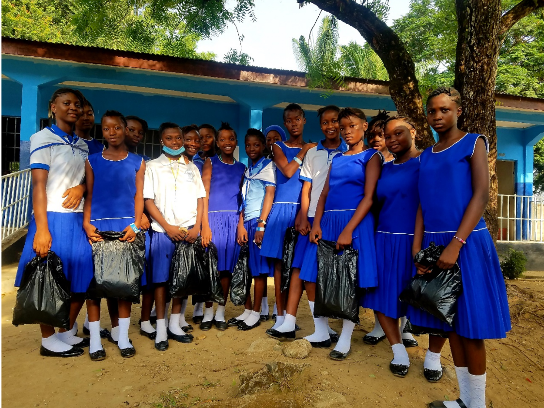
Ninth-grade girls in Sierra Leone who received free sanitary pads through our Just4You Sanitary Pad Drive in 2020.

addition, Jewel Sanitary Pads has donated 1000 pads to the Northern Virginia Business and Professional Women’s Club campaign. The pads collected in 2020 will be shipped to Sierra Leone and Liberia in 2021 for distribution.